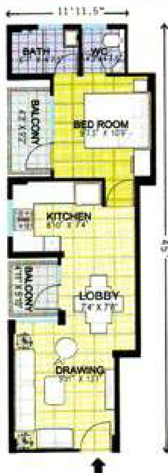
1 BHK Type - 1