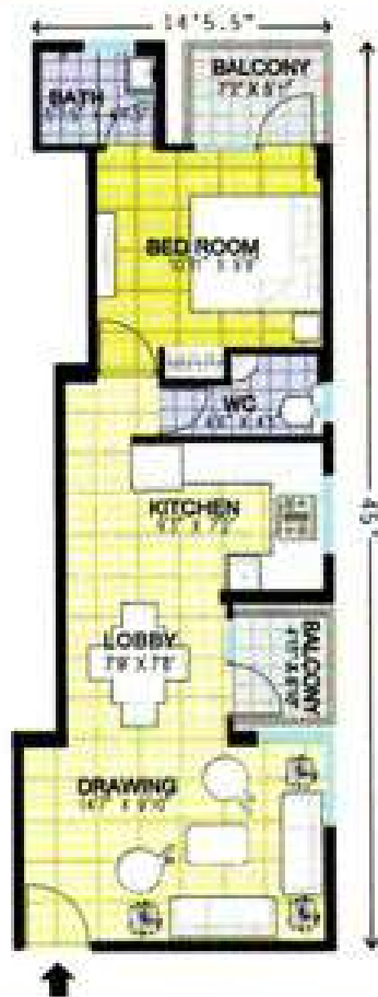
1 BHK Type - 2